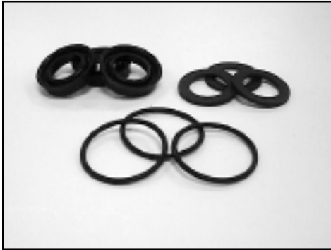
16025 Water Packing Kit